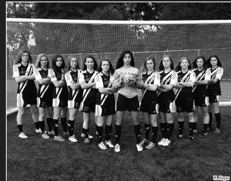
READY TO DEFEAT: The senior girls on the varsity team strike a fierce pose for their group photo.

From the beginning of the season, the JV girls aspired to go undefeated in their league. The Wildcats put their heads down and put in countless hours on the training field in order to make this goal a reality. The JV girls went undefeated throughout the season and preseason, only tying in three games overall. The final three games of the season resulted in three more wins, which secured the team's place at the top of the table. The team travelled to Milpitas, where it demonstrated its prowess and technical abilities as the team scored goal after goal. The final score was 7-0 LG. On Feb. 12, the team defeated Mountain View 3-1 at home. The team carried this momentum into its final game against Saratoga during break. Although several members were missing, the team never faltered. The girls battled it out and brought home its final 2-0 win of the season.